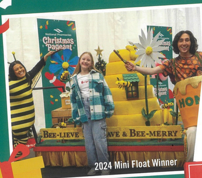
2024 Mini Float Winner

For more information head to christmaspageant.com.au